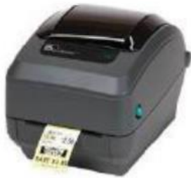
Zebra GK420t only at 1 station.